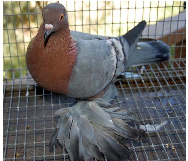
Experimental color in Saxon Field Pigeons: copper blue wing white barred. 2010 YC bred and owned by Gary Romig