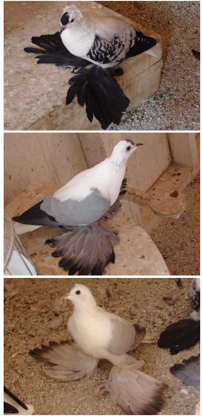
3 Photos of Perry Mueller's crop of young for 2010. Black Spangles, Blue and Silver Barless.