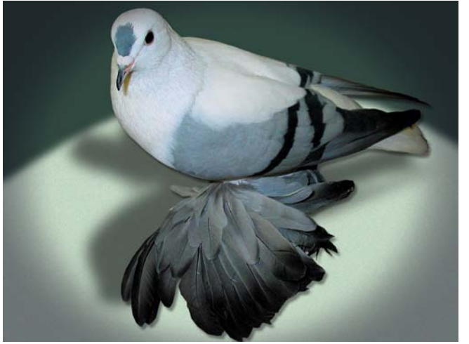
Blue black bar Silesian swallow at the 2008 Pageant. Bred and owned by Bill Greibel